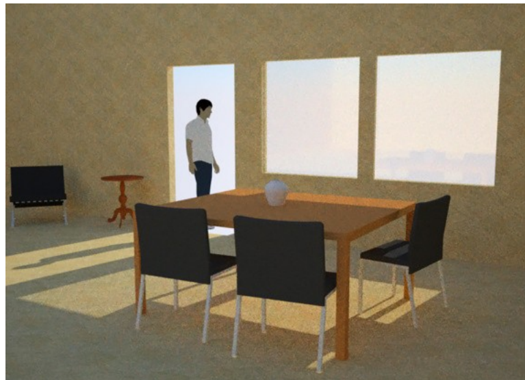
A friendly dining room scene